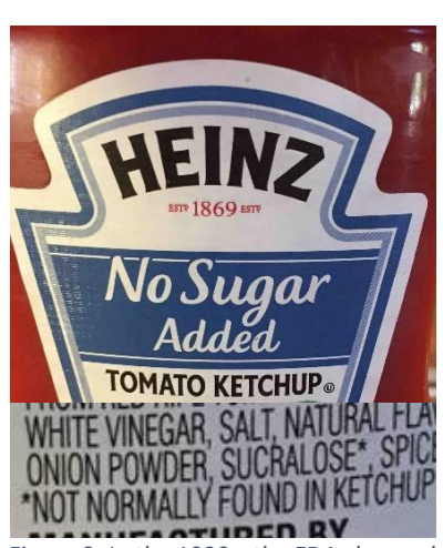
Figure 3: In the 1990s, the FDA changed the rules for standardized products to allow nutrient content claims like "no sugar added" in standardized foods like ketchup.

The agency again experimented with horizontal changes to the food standards in the 1990s. Following passage of the Nutrition Labeling and Education Act, FDA began expressly authorizing nutrient content claims such as "low fat," and "no sugar added," ensuring these terms met specific requirements.