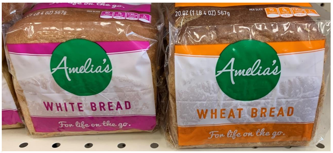
Figure 2: Products with minimal whole grain content are easily confused with "whole wheat bread."

Too often, manufacturers have chosen not to label the amount of key healthful ingredients. leaving consumers in the dark. For example, in the bread aisle, products with minimal amounts of whole wheat mimic 100% whole wheat bread, a standardized product. These competing breads are sold under distinctive names like "Wheat Bread," or "made with Whole Wheat Bread," which are easily confused with genuine whole grain bread (Fig. 2).