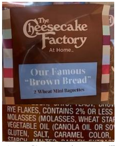
Figure 5. "Our Famous 'Brown Bread'" from Cheesecake Factory uses caramel color and molasses rather than whole grains to achieve its "brown" appearance.

A few of the proposed changes even more clearly run counter to public health goals. For example, colorings can be used to darken bread made primarily with refined grains, making it appear higher in whole grain and therefore healthier. The standard of identity for bread currently prohibits the use of colorings, <sup>40</sup> yet even with this restriction, companies make dubious use of caramel color and molasses to darken bread products that are made of mainly refined grains, conferring a health halo ( Fig 5 ). Expressly authorizing colorings in bread would exacerbate this existing problem, further misleading consumers.