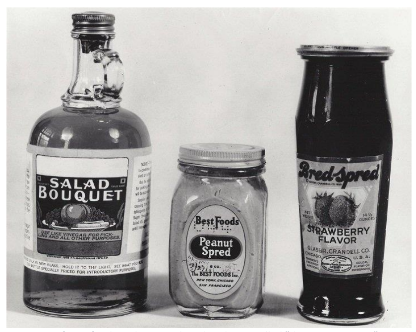
Figure 1: Inferior food products marketed under so-called "distinctive names" prior to passage of the FDCA in 1938. Image Source: FDA

Under the 1938 law that created FDA's current food standards authority, Congress authorized federal food regulators to pursue enforcement action against any manufacturer selling a product that "purported to be" a standardized product, provided that product did not meet the relevant standards. This authority prevented companies from inventing new, distinctive names for products like "bred spred," or "peanut spread," which were marketed to compete with foods made from higher-quality and more expensive ingredients, like jam or peanut butter ( Fig. 1 ).